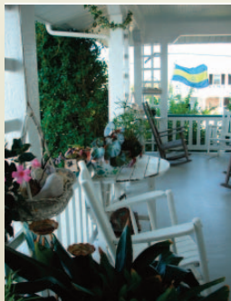
One of the beautiful porches

On Saturday August 23, 2008 from 5 to 7:30 a house